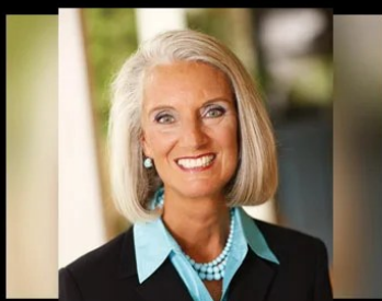
ANNE GRAHAM LOTZ AnGeL Ministries