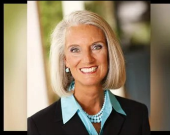
ANNE GRAHAM LOTZ AnGeL Ministries